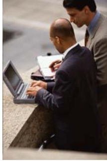
empowering business for today and tomorrow